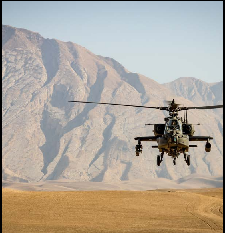
Unsung Heroes: Interpreters in the Afghanistan War